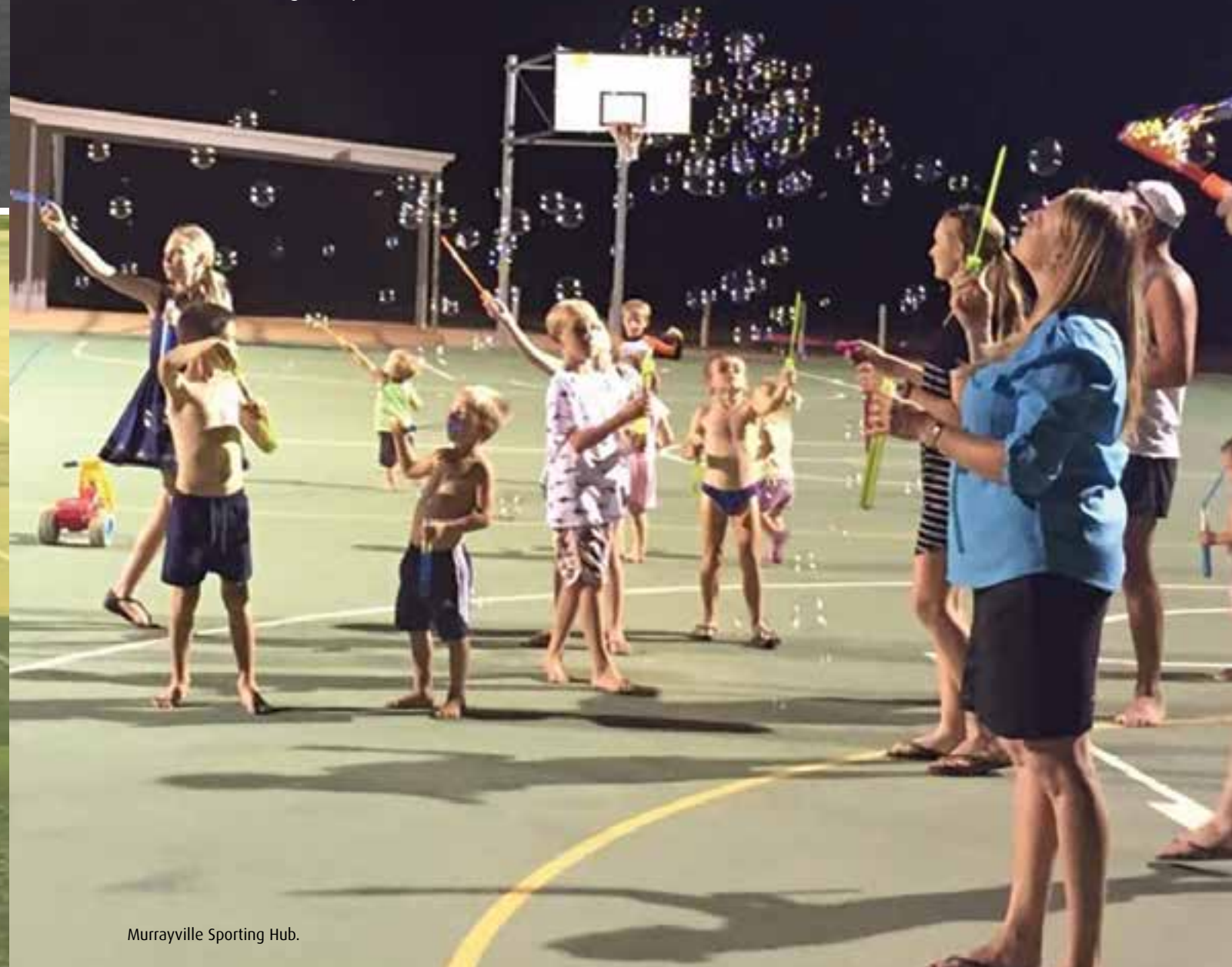
Murrayville Sporting Hub.