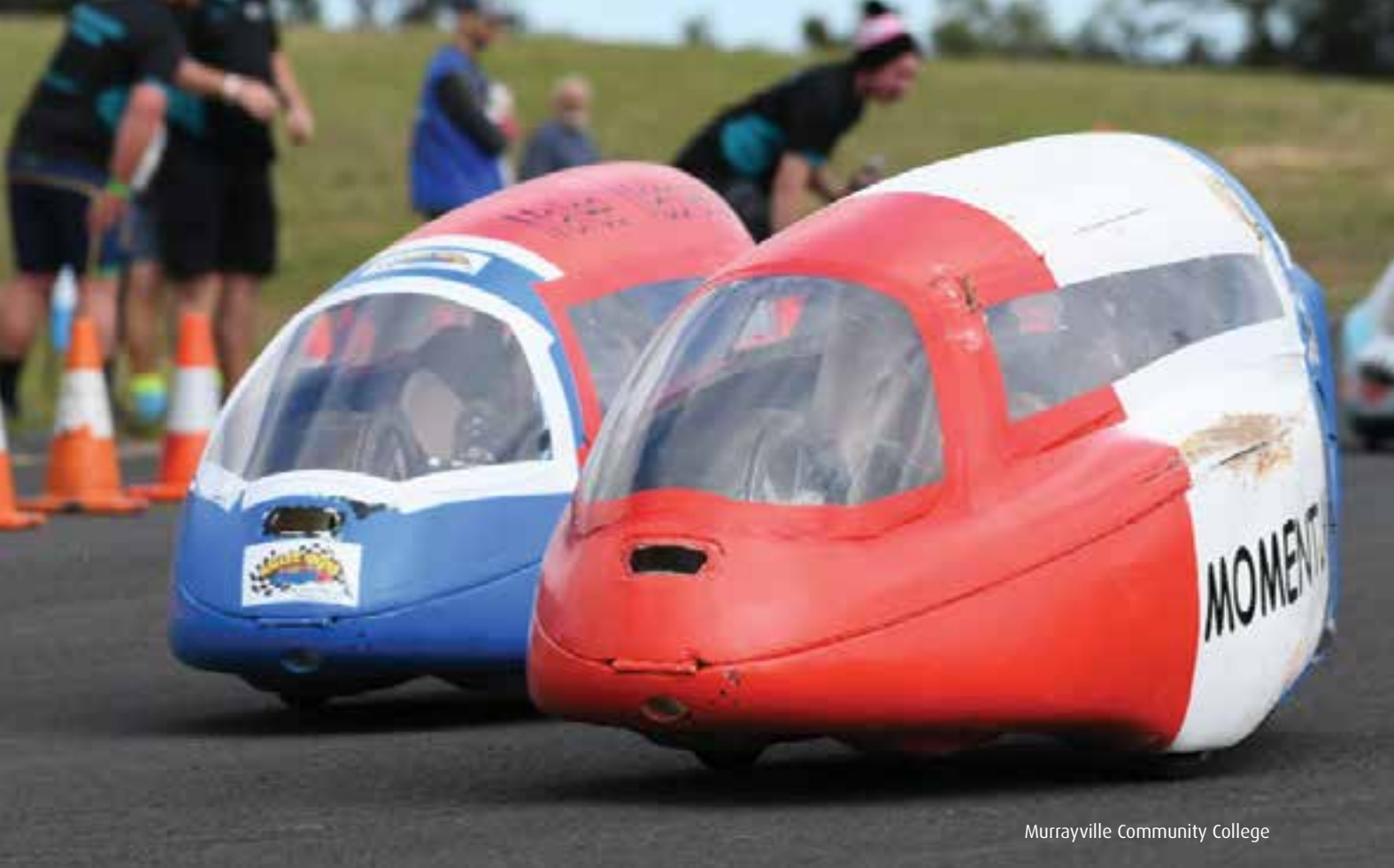
Murrayville Community College