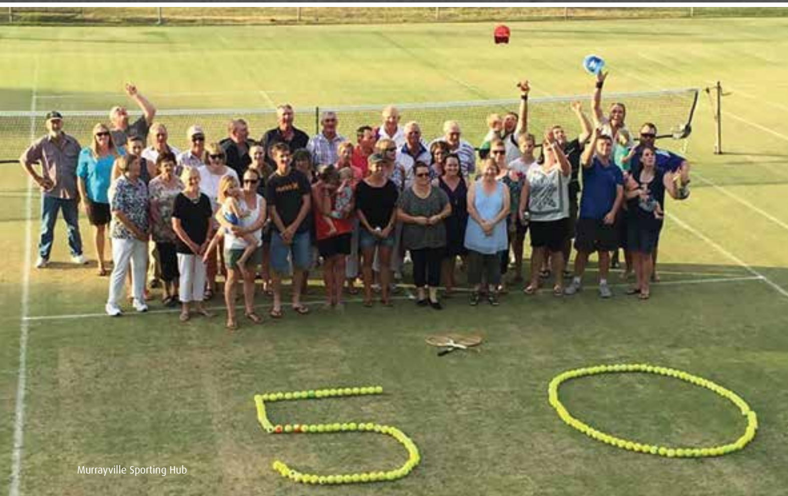
Murrayville Sporting Hub